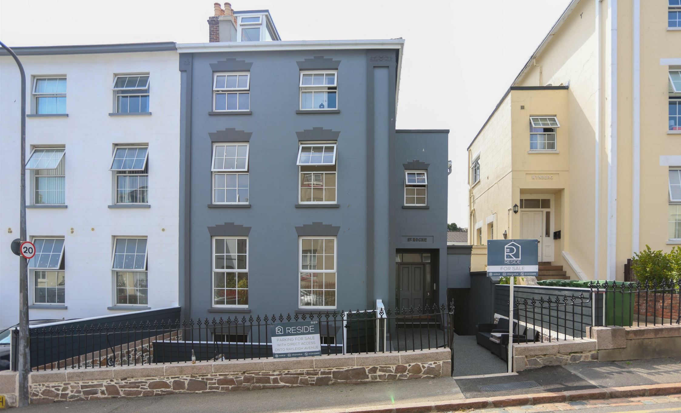
3, St Roche Apartments Raleigh Avenue, St Helier, Jersey, JE2 3ZG £439,000